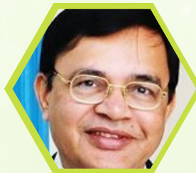
Jay Shah Academy of Indian Marketing